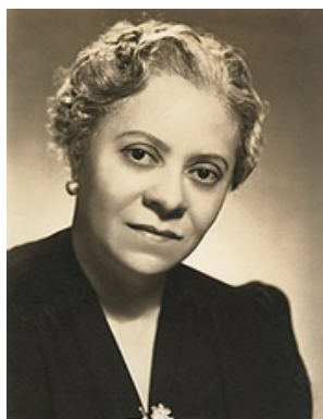
Florence B. Price