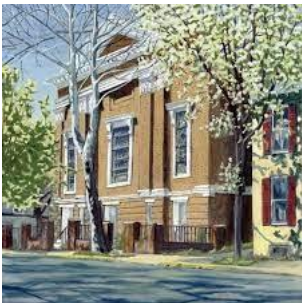
Market Street United Methodist Church (Event Begins Here)

Tickets Available on EventBrite.com $50 each Scan the adjacent QR code or search "AGO" at eventbrite.com