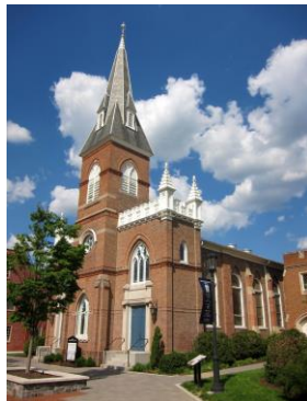
First Presbyterian Church (Main Course is Served Here)