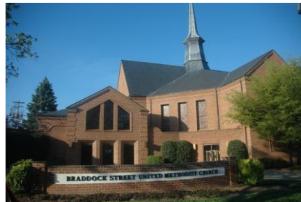
Braddock Street United Methodist Church (Dessert and Final Concert)