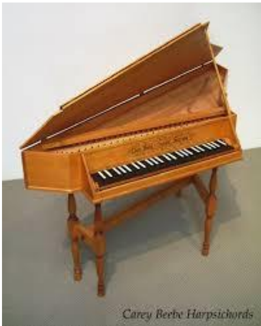
English bentside spinet