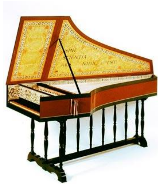
Flemish single manual harpsichord